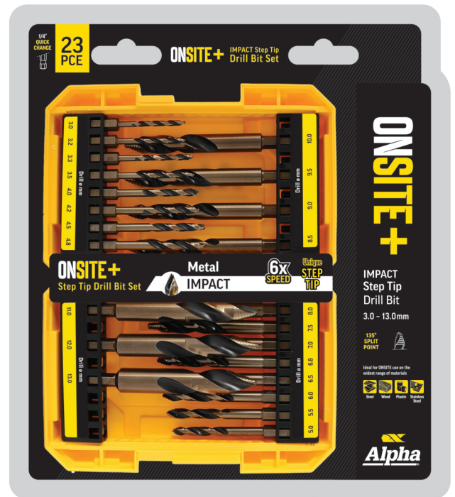
23 PCE SET Sizes 3.0 - 13.0mm