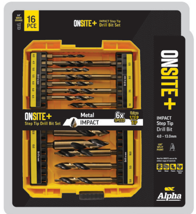
16 PCE SET Sizes 4.0 - 13.0mm