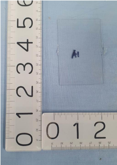
Cavity switch thermoplastic sample 1