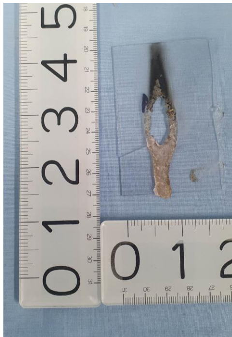
Cavity switch thermoplastic sample 2 after needle flame test

This report is issued within the scope of A2LA accreditation #2765.02.