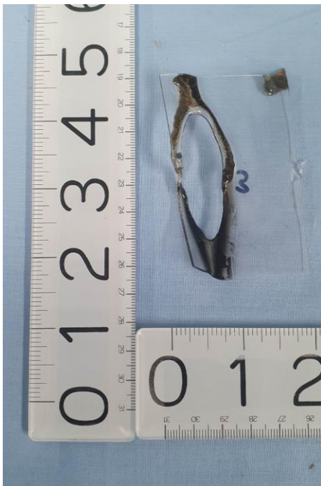
Cavity switch thermoplastic sample 3 after needle flame test

This report is issued within the scope of A2LA accreditation #2765.02.