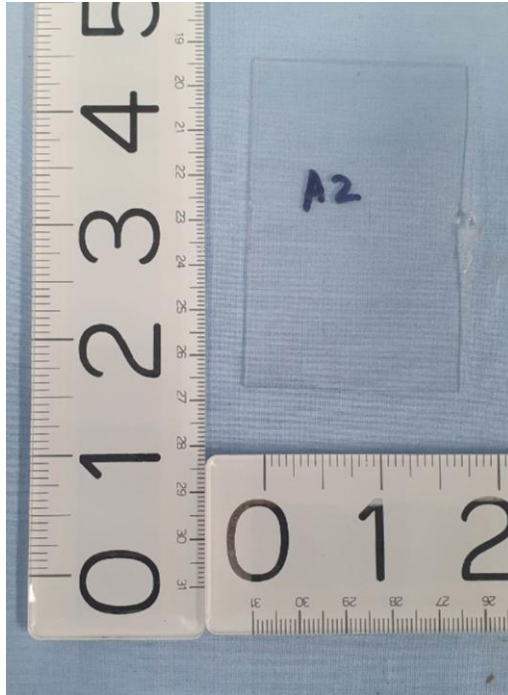
Cavity switch thermoplastic sample 2