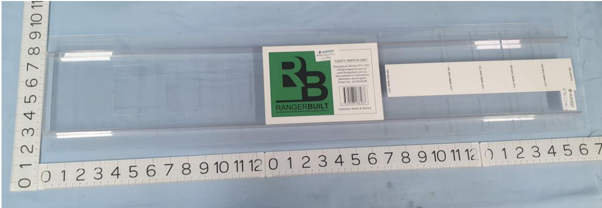
Cavity switch unit- Front