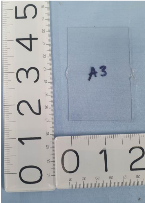
Cavity switch thermoplastic sample 3