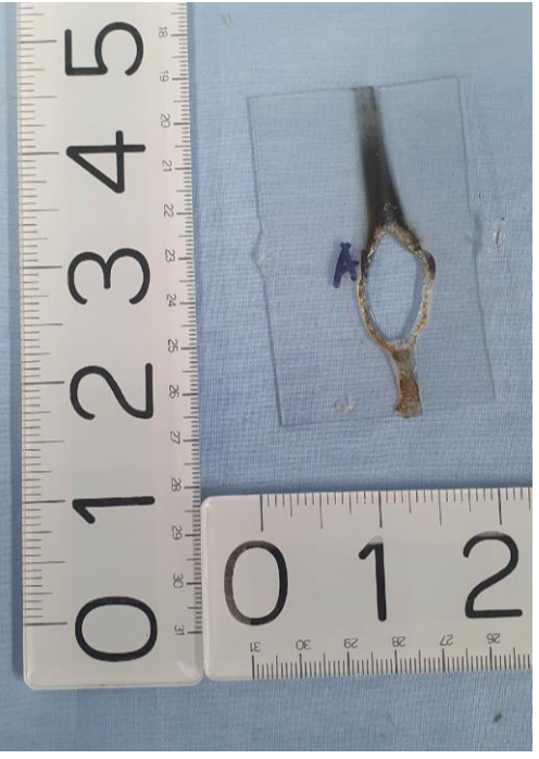
Cavity switch thermoplastic sample 1 after needle flame test

This report is issued within the scope of A2LA accreditation #2765.02.