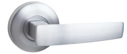
AURORA PASSAGE LEVERSET PICTURED FINISH Brushed Satin Chrome PART NUMBER 1905AUR (Visual Pack) 1900AUR (Trade Pack - latch sold separately)*