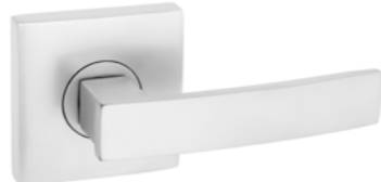
ANGULAR PASSAGE SQUARE LEVERSET PICTURED FINISH Satin Chrome PART NUMBER 1805ANG (Visual Pack) 1800ANG (Trade Pack - latch sold separately)