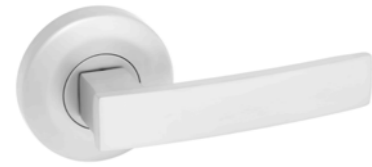
ANGULAR PASSAGE ROUND LEVERSET PICTURED FINISH Satin Chrome PART NUMBER 1905ANG (Visual Pack) 1900ANG (Trade Pack - latch sold separately)