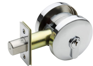
SMOOTH ROUND DEADBOLT DOUBLE CYLINDER PICTURED FINISH Bright Chrome PART NUMBER 1951SM AVAILABLE FINISHES SC, BC, MB, BSC.