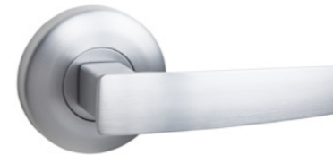
AURORA DUMMY LEVERSET PICTURED FINISH Brushed Satin Chrome PART NUMBER 1920AUR