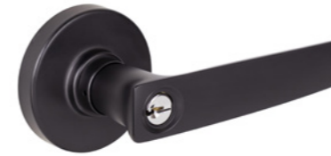
AURORA ENTRANCE LEVERSET PICTURED FINISH Matt Black* PART NUMBER 1940AUR