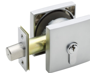
SMOOTH SQUARE DEADBOLT SINGLE CYLINDER PICTURED FINISH Satin Chrome PART NUMBER 1846SM AVAILABLE FINISHES SC, MB, BC.