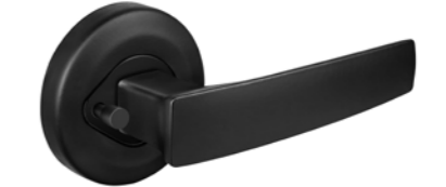
AURORA PRIVACY LEVERSET PICTURED FINISH All Matt Black PART NUMBER 1915AUR (Visual Pack) 1910AUR (Trade Pack)*