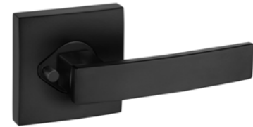
ANGULAR PRIVACY SQUARE LEVERSET PICTURED FINISH All Matt Black PART NUMBER 1815ANG (Visual Pack) 1810ANG (Trade Pack)