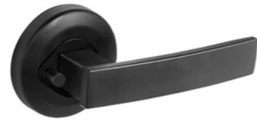
ANGULAR PRIVACY ROUND LEVERSET PICTURED FINISH All Matt Black PART NUMBER 1915ANG (Visual Pack) 1910ANG (Trade Pack)